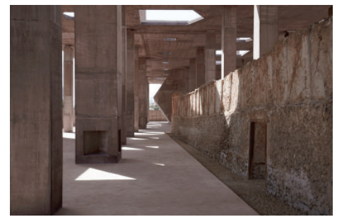
Pearling Pathway Entry (old and new)

I also hope to contribute this research to architectural journals (including Fresh Meat, which will focus its next issue on material matters), and share the work with the AIA-Chicago and hopefully future students.